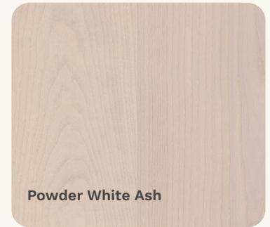
Powder White Ash